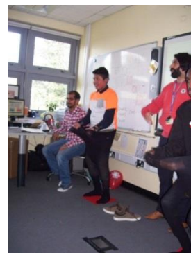
Playing fun games using stockings and air balls!