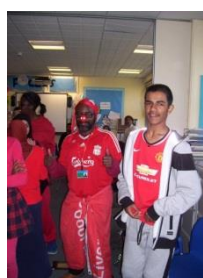
Dressing up in red!