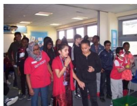
Lined up and ready to play the game!